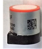
POLI Sensor Module

mPower sensors are all smart sensors that can carry with them calibration data. The connecting adapters depend on the type of instrument: 7-pin connectors for all UNI instruments and black wedge-shaped connection modules for all POLI instruments.