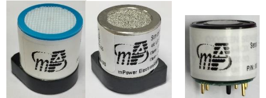
POLI Sensor Modules

mPower sensors are all smart sensors that can carry with them calibration data. The connecting adapters depend on the type of instrument: 7-pin connectors for all UNI instruments and black wedge-shaped connection modules for all POLI instruments.