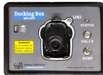
UNI Docking Box