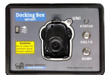
UNI Docking Box