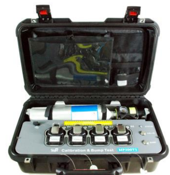
CaliCase Docking Station