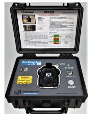
UNI Docking Box